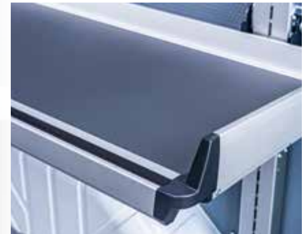
Reduction of the carbon footprint due to CO 2 -neutral production using recycled material