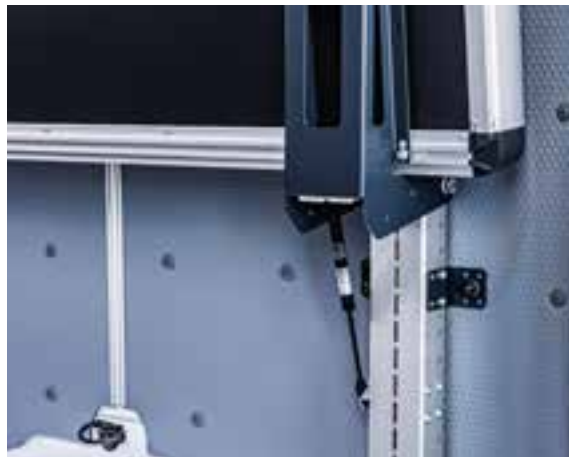
Enhanced efficiency due to folding shelves with gas struts for one-handed operation