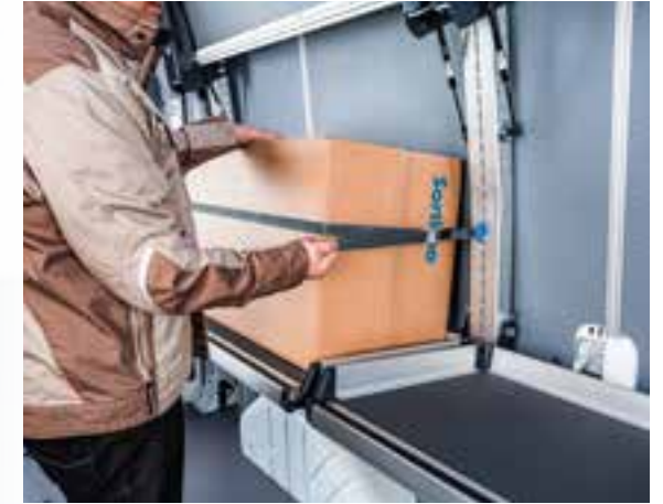
Time savings due to integrated load securing with ProSafe