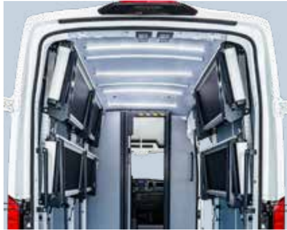
Optimum use of the loading space, as the system can be adapted to the shape of the vehicle